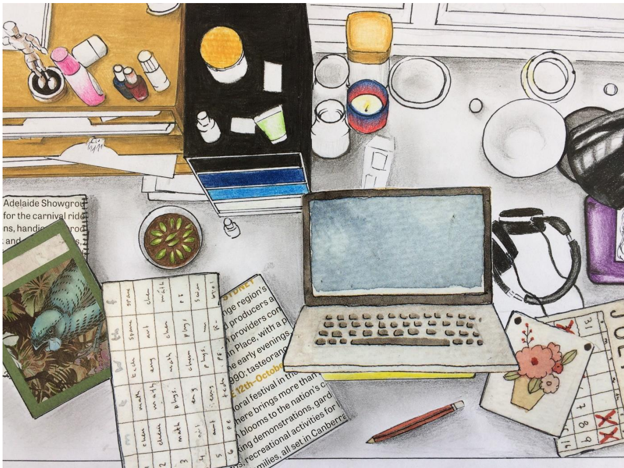
Above image: Tessa Ballard year 11, Interiors , Mixed media collage, 2020.