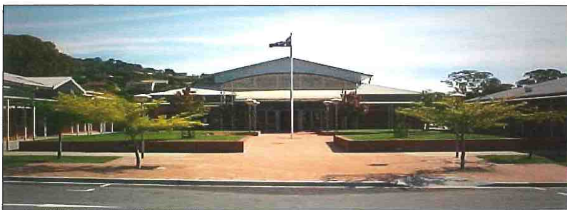
Image: Front of school at Theodore Primary