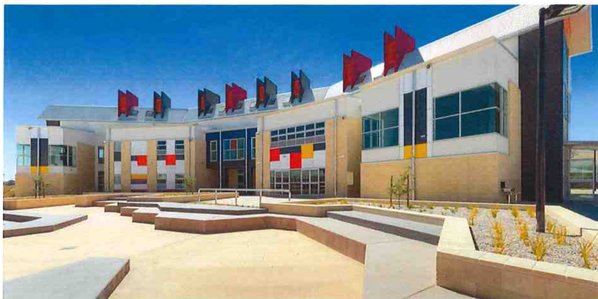
Harrison School – VAST Building (High School Science, Food Technology and Canteen Hub)